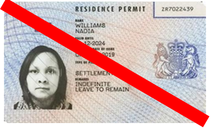
Front: British format BRC and BRP issued from 1 January 2021