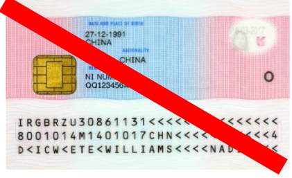
Back: EU format BRC and BRP issued until 31 December 2020